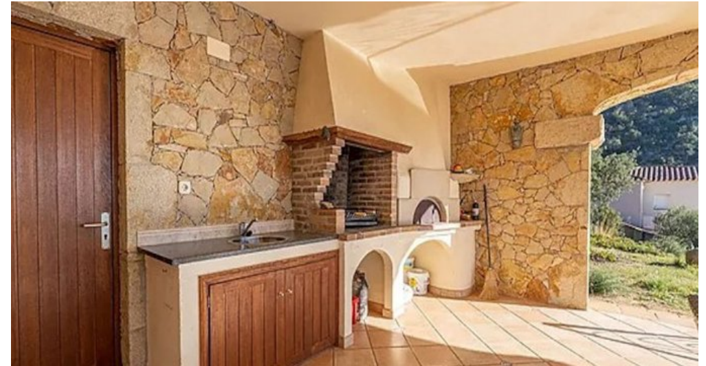
Spanien Costa-Brava Ferienhaus