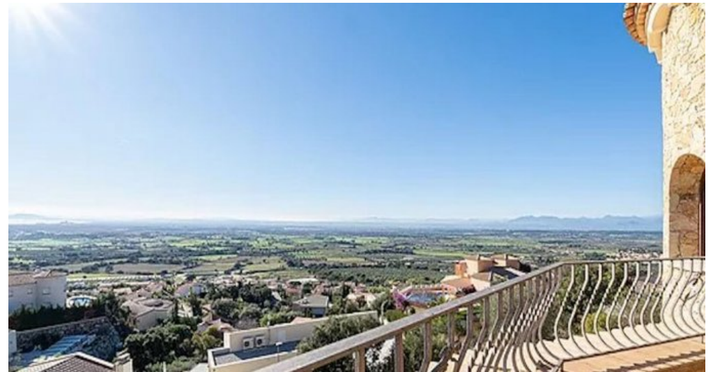
Spanien Costa-Brava Ferienhaus