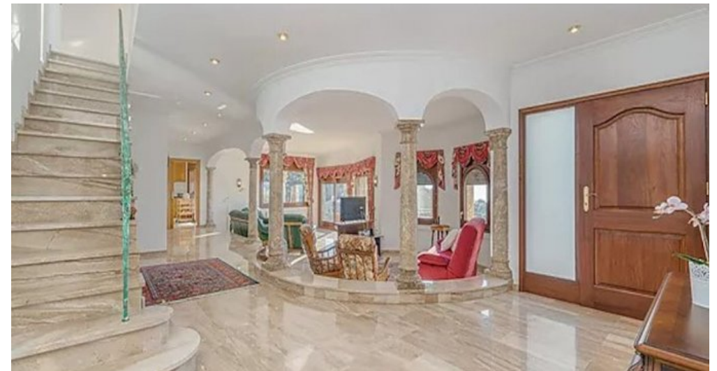
Spanien Costa-Brava Ferienhaus