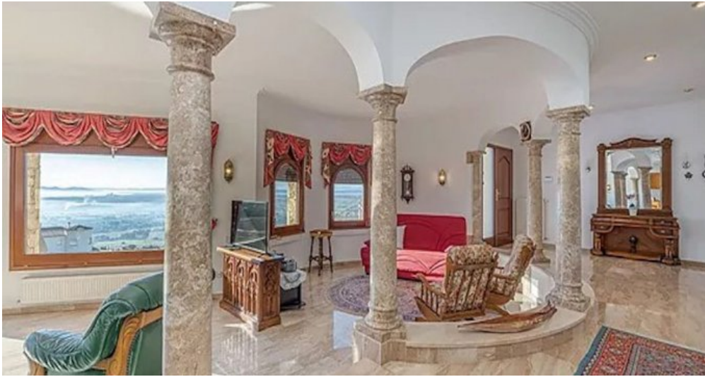
Spanien Costa-Brava Ferienhaus