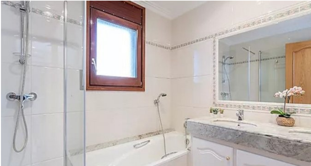
Spanien Costa-Brava Ferienhaus