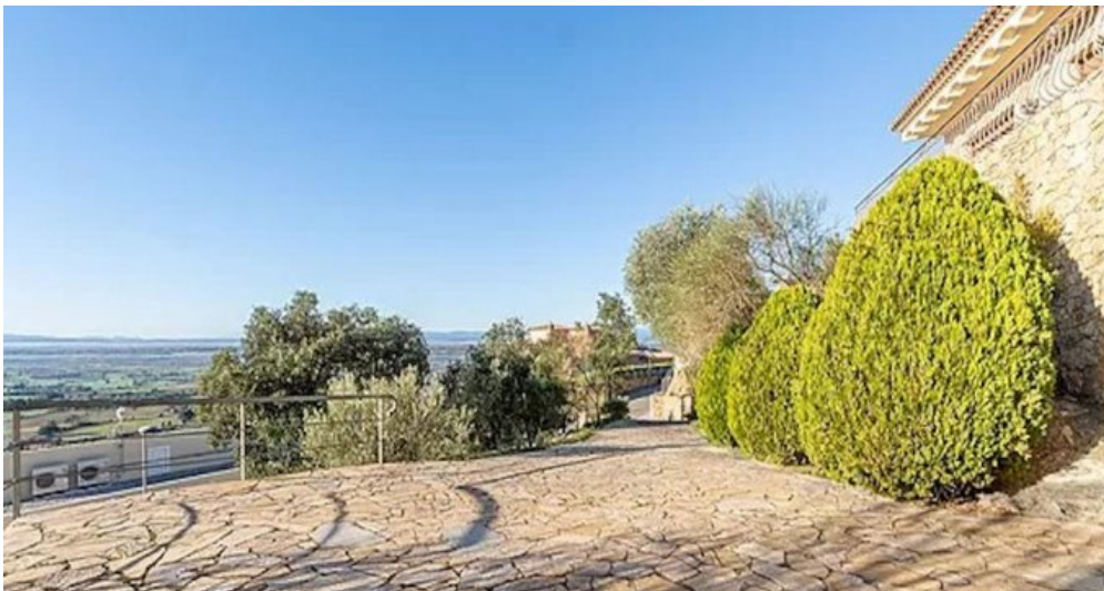
Spanien Costa-Brava Ferienhaus