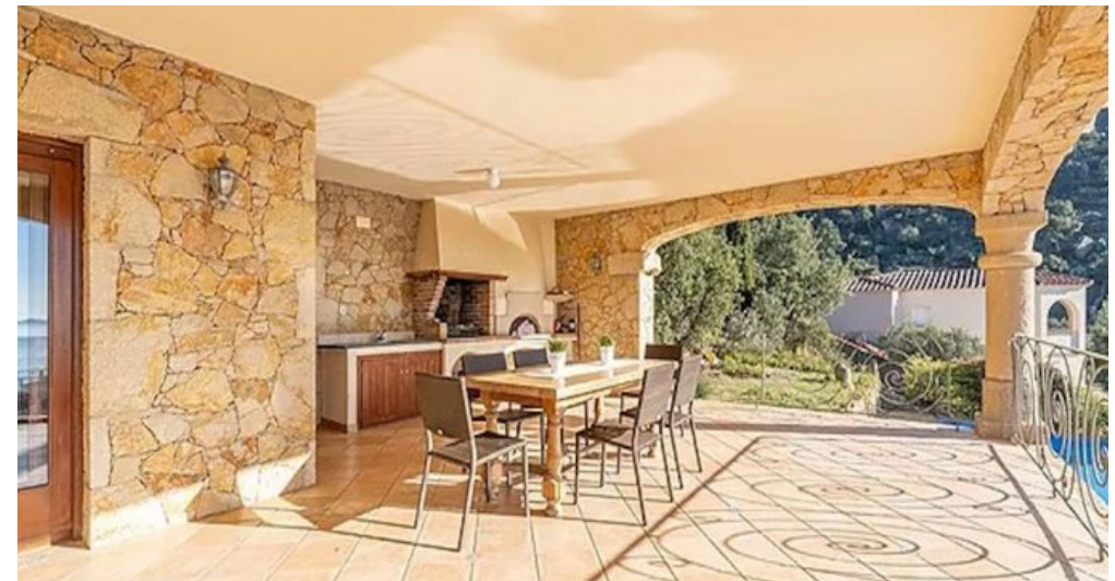
Spanien Costa-Brava Ferienhaus