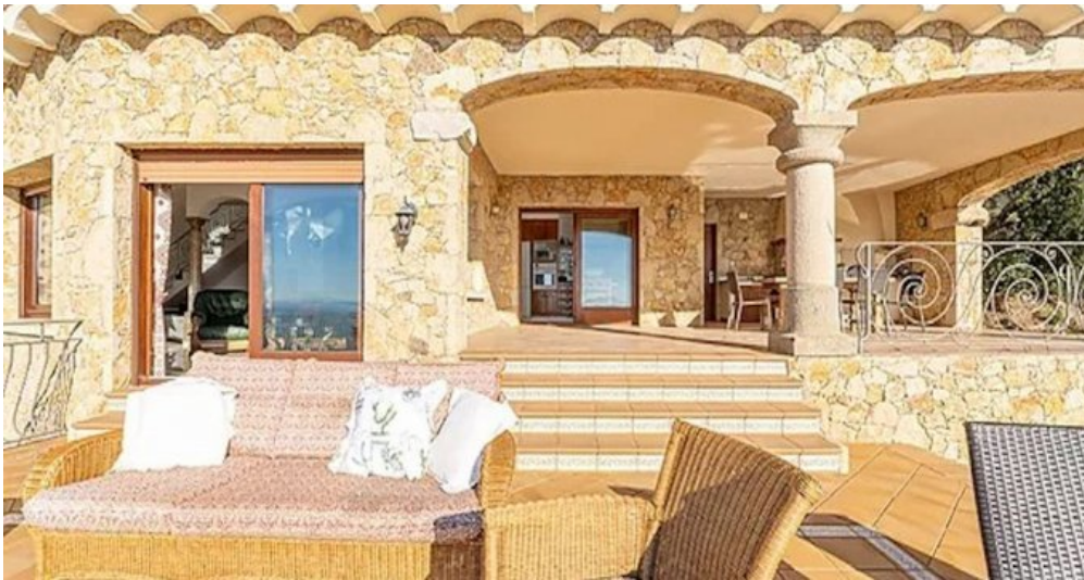
Spanien Costa-Brava Ferienhaus