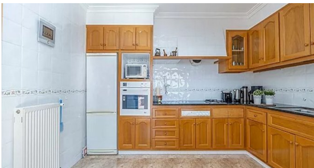
Spanien Costa-Brava Ferienhaus