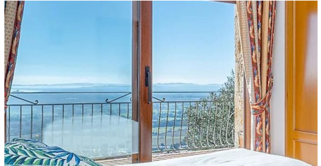
Spanien Costa-Brava Ferienhaus