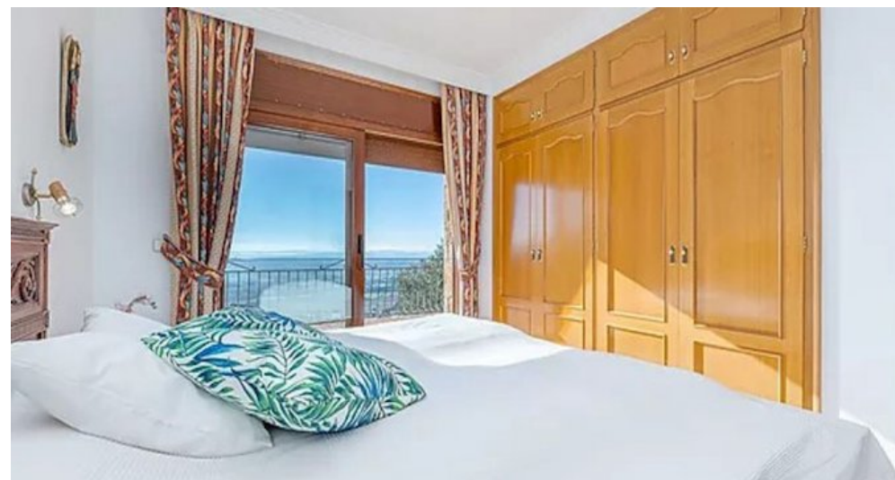
Spanien Costa-Brava Ferienhaus