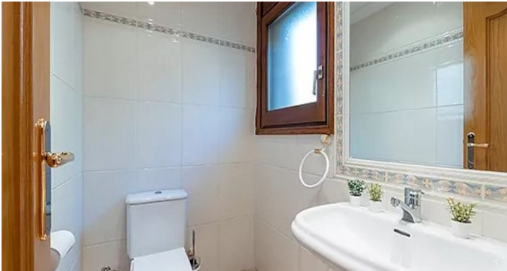
Spanien Costa-Brava Ferienhaus