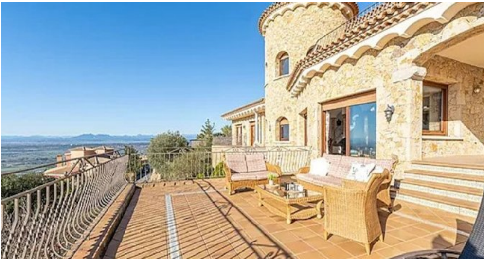
Spanien Costa-Brava Ferienhaus