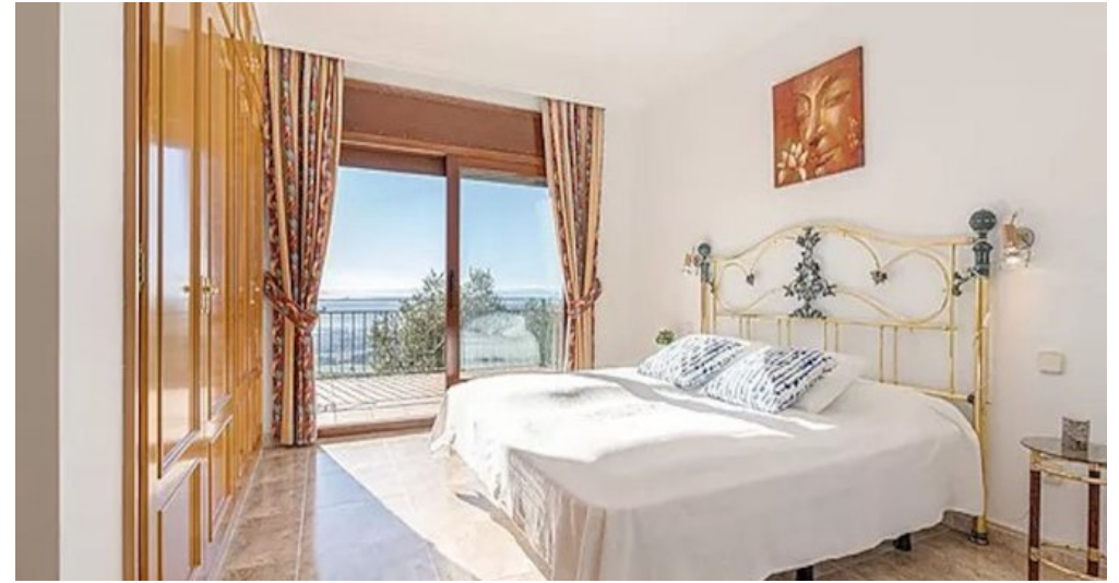
Spanien Costa-Brava Ferienhaus