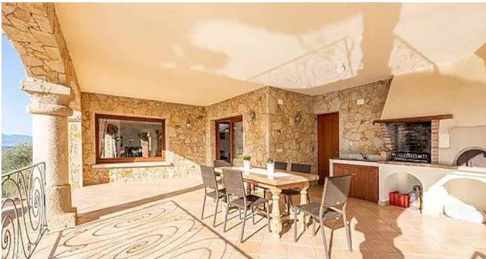
Spanien Costa-Brava Ferienhaus