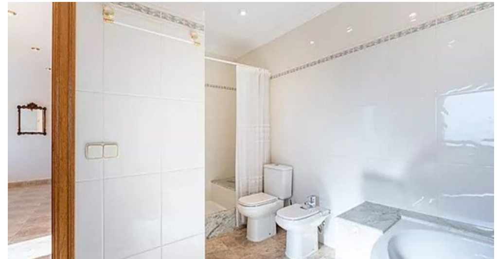
Spanien Costa-Brava Ferienhaus