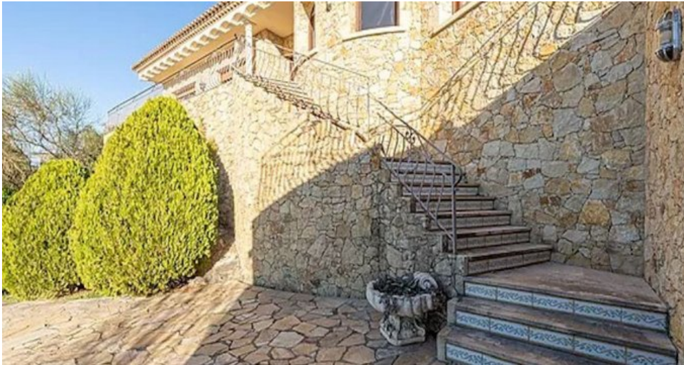
Spanien Costa-Brava Ferienhaus