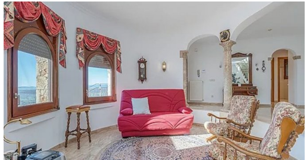
Spanien Costa-Brava Ferienhaus