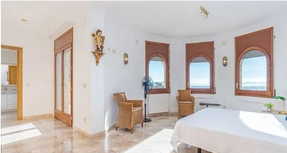
Spanien Costa-Brava Ferienhaus