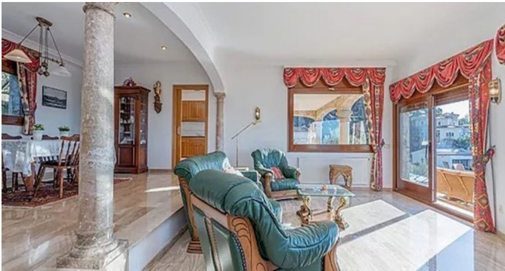
Spanien Costa-Brava Ferienhaus