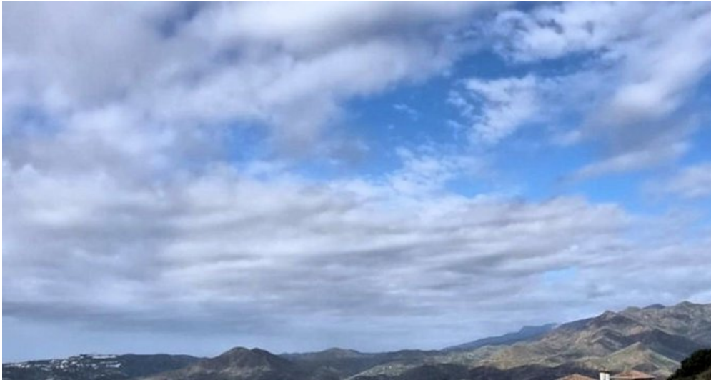
Modernes Ferienhaus Costa del Sol in Valtocado zu verkaufen