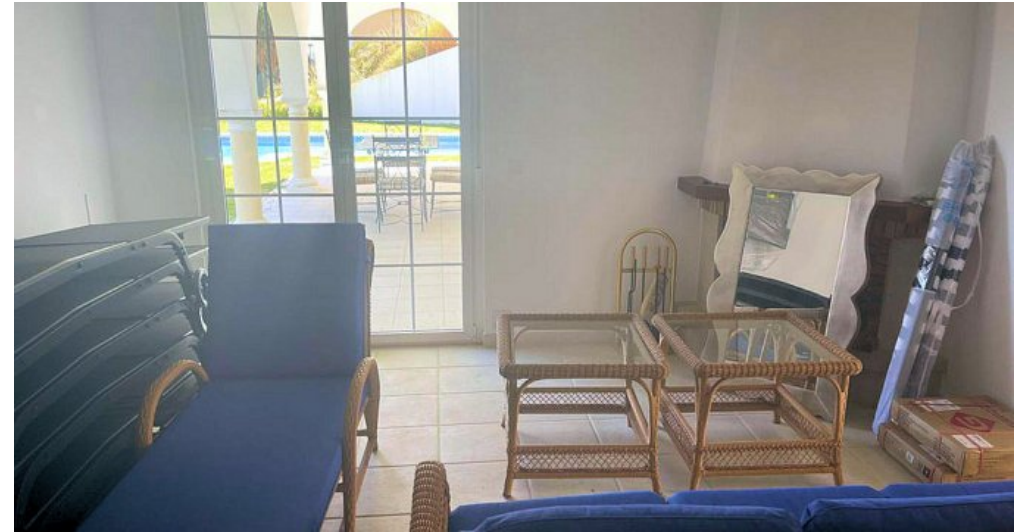
Modernes Ferienhaus Costa del Sol in Valtocado zu verkaufen