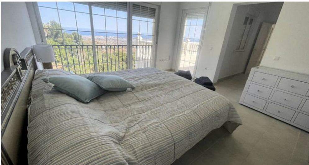
Modernes Ferienhaus Costa del Sol in Valtocado zu verkaufen