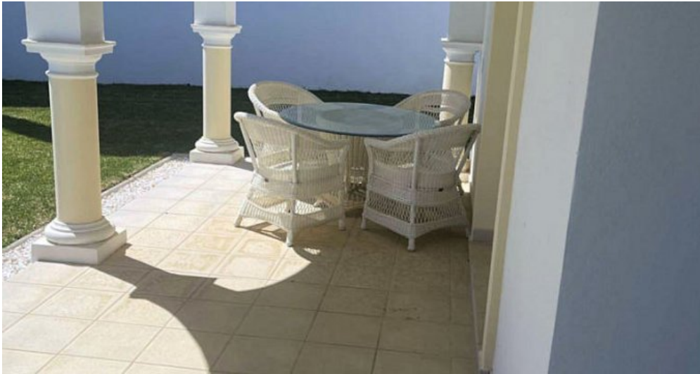
Modernes Ferienhaus Costa del Sol in Valtocado zu verkaufen