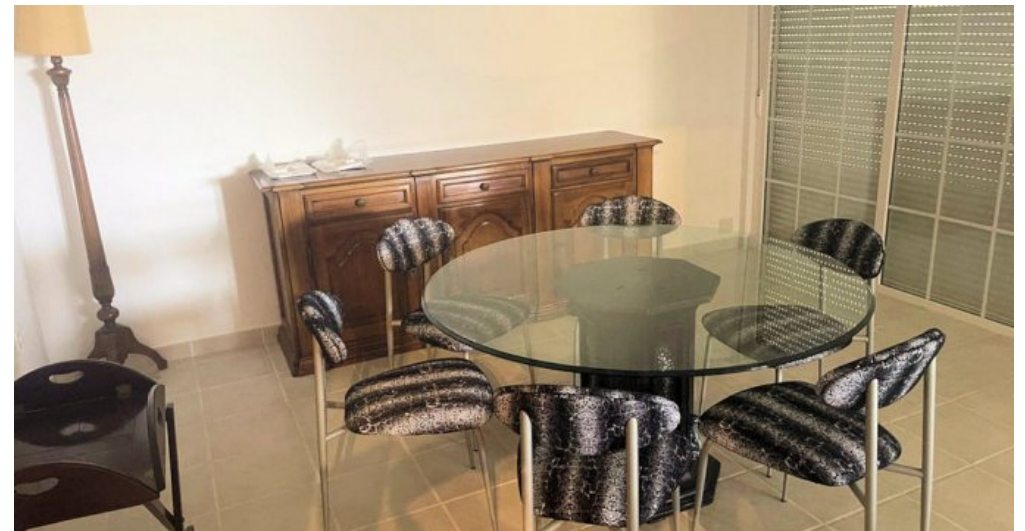
Modernes Ferienhaus Costa del Sol in Valtocado zu verkaufen