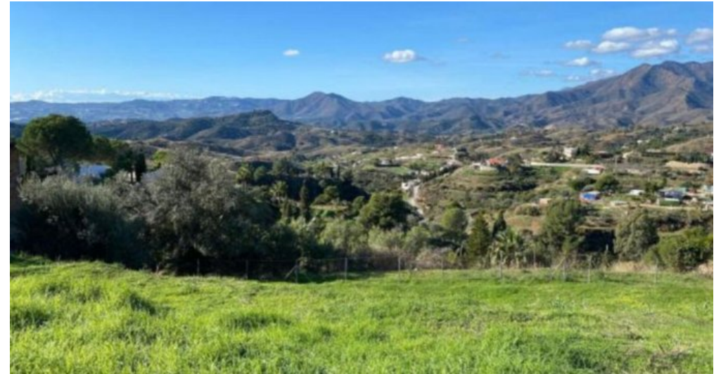
Modernes Ferienhaus Costa del Sol in Valtocado zu verkaufen