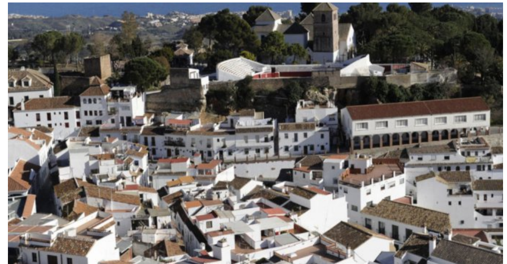
Modernes Ferienhaus Costa del Sol in Valtocado zu verkaufen