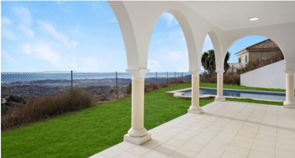
Modernes Ferienhaus Costa del Sol in Valtocado zu verkaufen