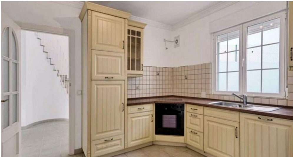
Modernes Ferienhaus Costa del Sol in Valtocado zu verkaufen