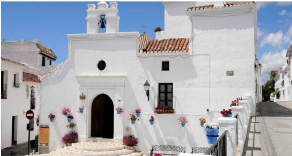
Modernes Ferienhaus Costa del Sol in Valtocado zu verkaufen