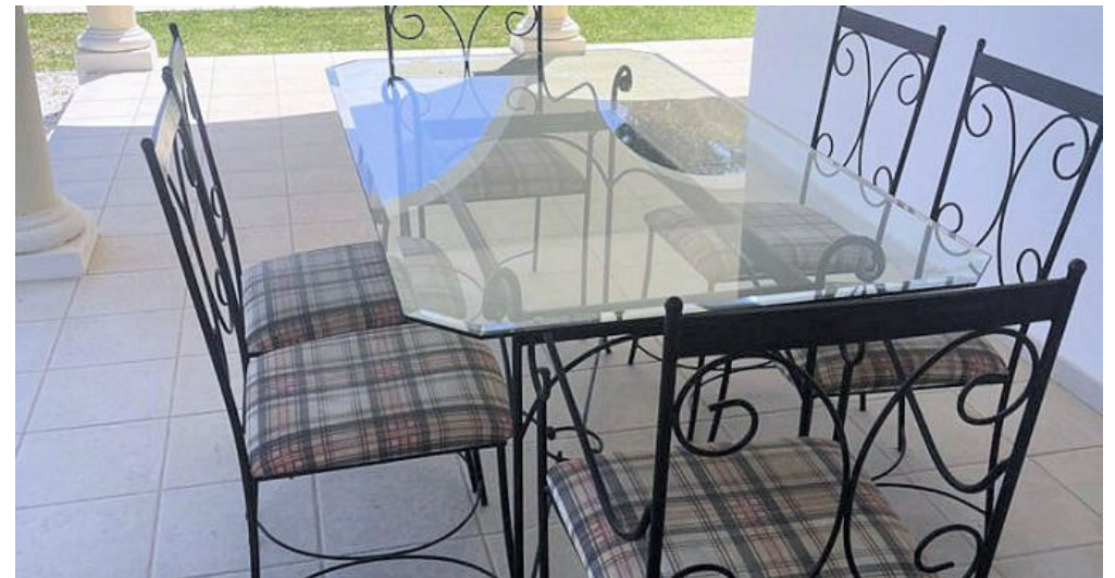
Modernes Ferienhaus Costa del Sol in Valtocado zu verkaufen