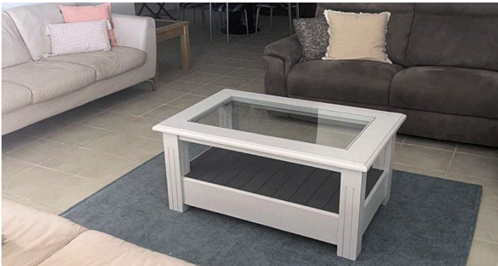
Modernes Ferienhaus Costa del Sol in Valtocado zu verkaufen