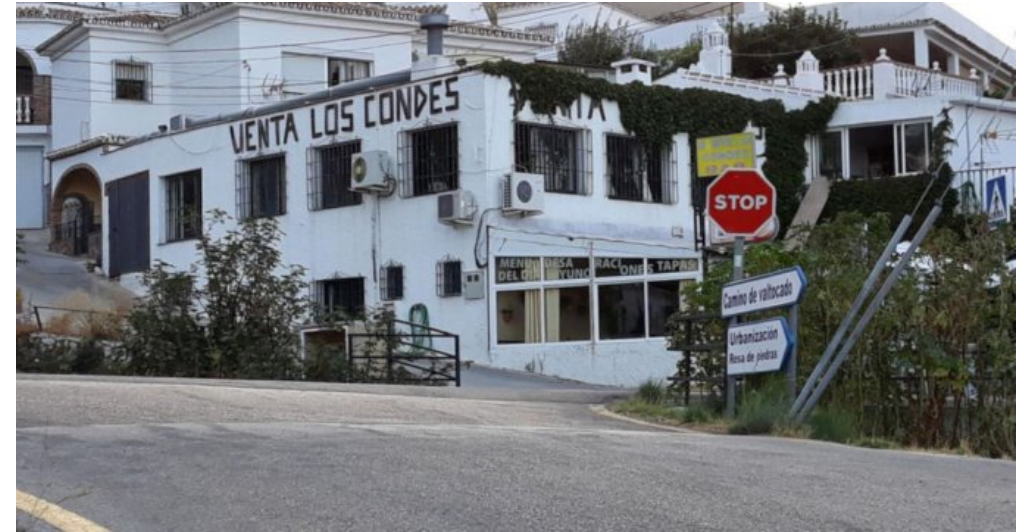
Modernes Ferienhaus Costa del Sol in Valtocado zu verkaufen